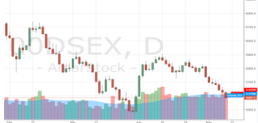
DSEX Technical Graph for last Three months