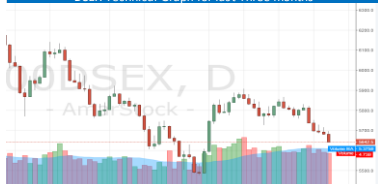
DSEX Technical Graph for last Three months