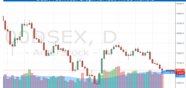
DSEX Technical Graph for last Three months