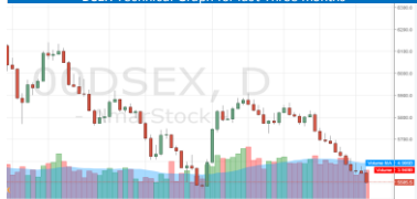
DSEX Technical Graph for last Three months