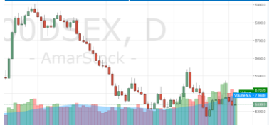
DSEX Technical Graph for last Three months