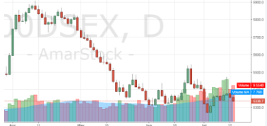
DSEX Technical Graph for last Three months