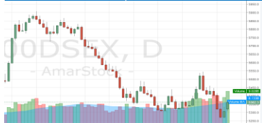
DSEX Technical Graph for last Three months